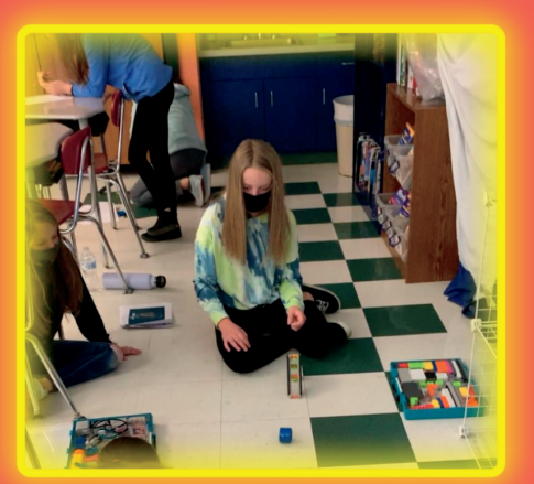
💡 Authentic Learning