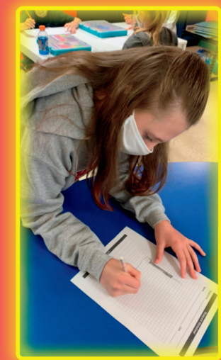
💡 Career Ready Skills